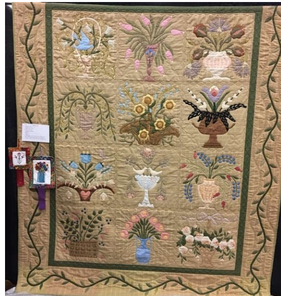
Judges' Choice – "My Botanika"