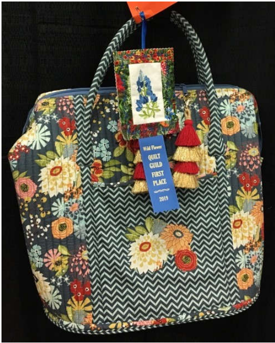
Wearable, 1st place – “Flower Power” Stacy Clady (quilted by Stacy Clady)